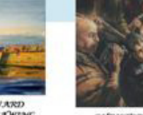
CHRISTOPHER TODD OIL PAINTING