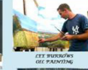
LEE BURROWS OIL PAINTING